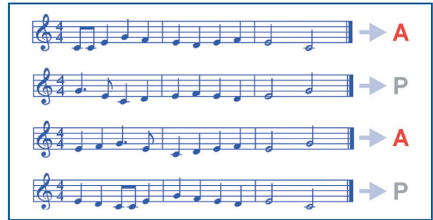
Figure 1: Active/passive melody learning task used in Mutschler et al., 2007. Subjects learned to play two unknown melodies on a piano (actively learned melodies, marked 'A') and were passively familiarized with two other melodies (passively learned melodies, marked 'P'). The assignment to the two learning conditions was balanced across subjects.

sively learned melodies' condition subjects listened passively to and were thus familiarized with the piece (Fig. 1). We found increased fMRI responses to actively compared with passively learned melo-